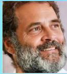
CONGRESS 99 INDIA alliance 234

has got 63 seats less compared to last election. The wave that was going strong since 2014 and gave BJP such an edge in the last two elections, weakened. So low was the morale of many in the opposition, due to the exit polls that they got delighted with the result, feeling that they are back in contention and upcoming Assembly polls may see a resurgence of Congress. However, it is true that BJP still has a very high percent of votes polled, despite a minor decrease. Congress' vote percent went up a bit, but it is still far less than the BJP. All eyes are now on PM Modi as to how he goes ahead with the economic policies, deals with unemployment & what will be his stand on contentious issues apart from hate speeches, communalism & other major issues.