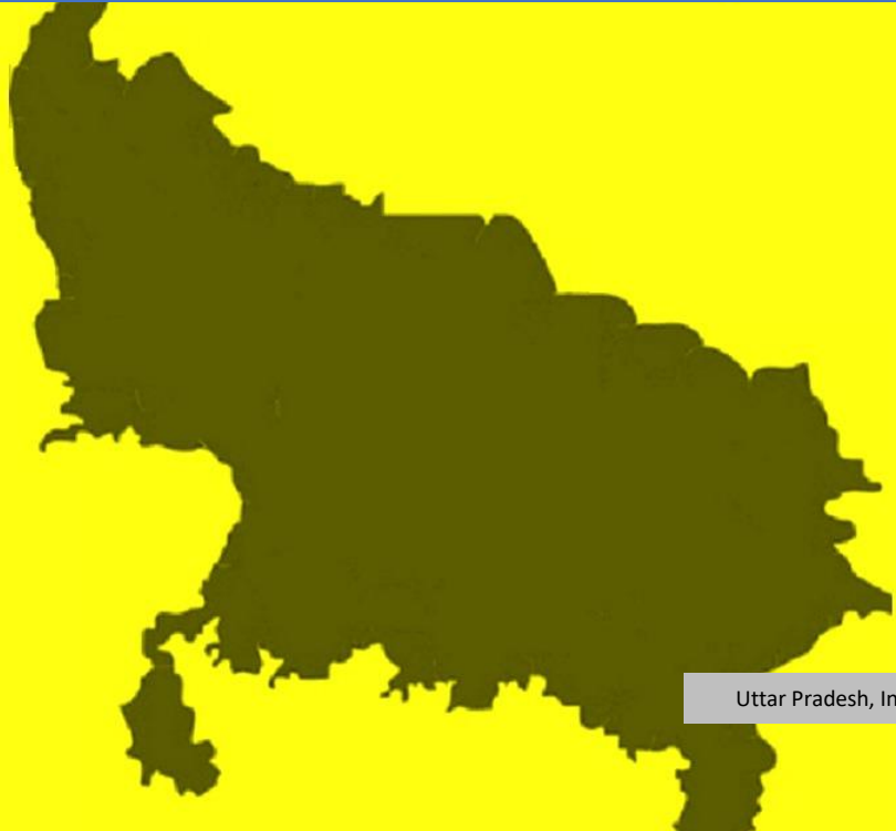
Uttar Pradesh, India

This is the reason that there have been repeated demands in the past to divide the state into four or five units for the sake of better administration and ease of governance.