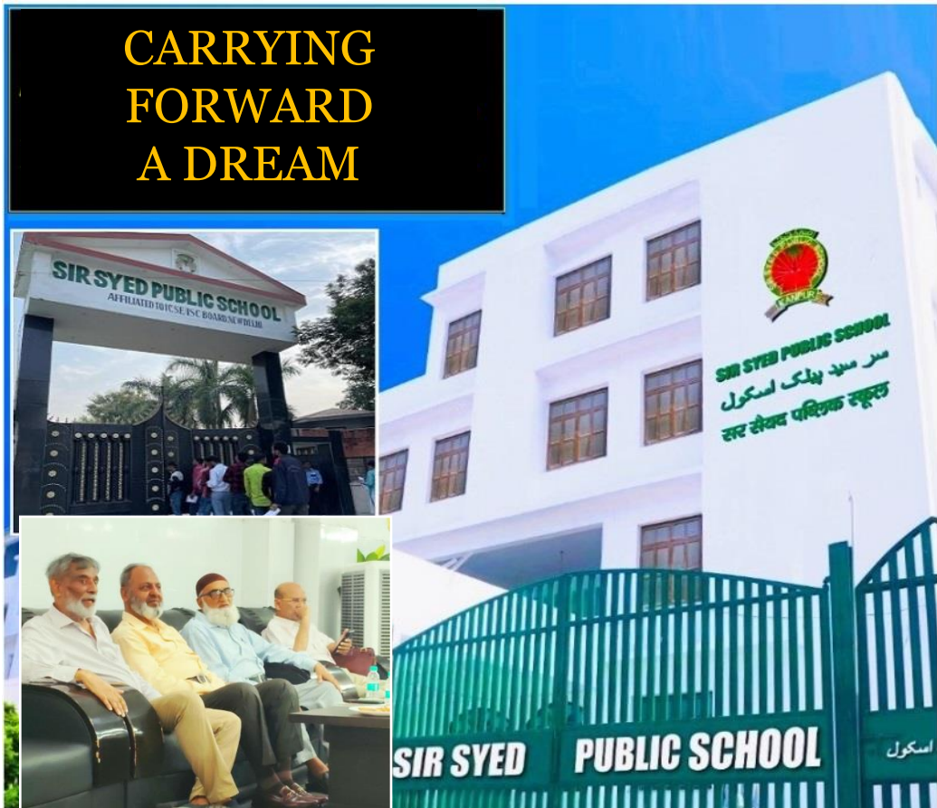
Photos of Sir Syed Public Schools in Kanpur (right) & Unnao (inset).