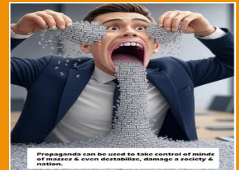
Propaganda can be used to take control of minds of masses & even destabilize, damage a society & nation.